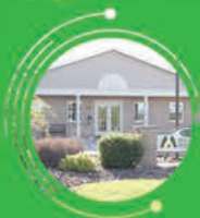
Miller Weldmaster Corporate Headquarters Navarre, Ohio