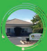
Miller Weldmaster West Coast Diamond Springs, California